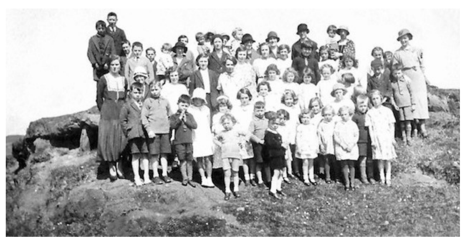
Jubilee Tea party on Gigha in 1935.